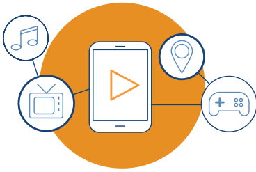
Manage Digital Rights