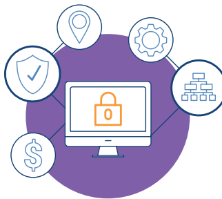
Prevent Online Fraud