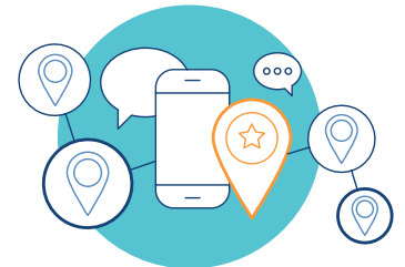
Target Mobile Users